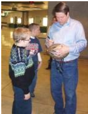
Helmets being autographed

On Friday, Feb. 3, 2006 GreeneBucs with the Dayton Bombers sponsor "Rusty Wallace" at the Nutter Center. The day before several volunteers and 2 AMTRYKE riders were at the Nutter Center to be featured on "BUCHERS BEAT" on Channel 2 A.M. news. The event turned out to be a huge success and lots of fun for all participants.