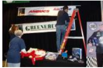
Roger & Gussie setting the stage