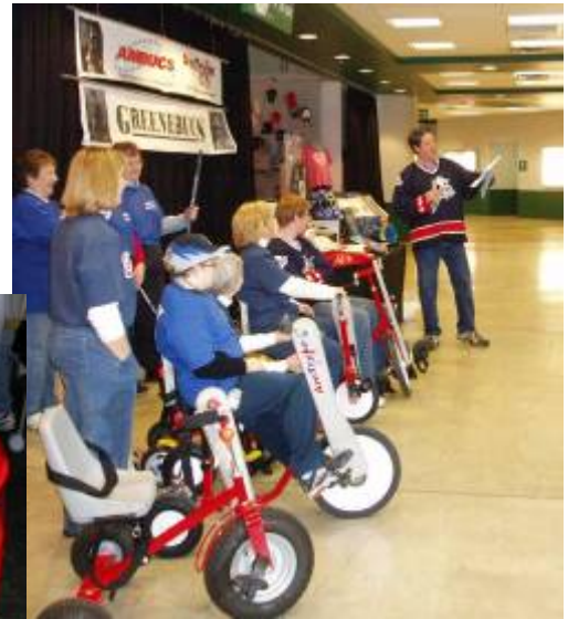
Bucher & early risers before TV show