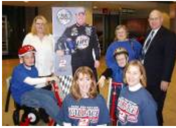
Riders With Parents And Volunteers.